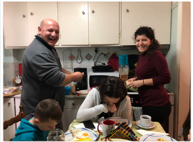
Breakfast with his family